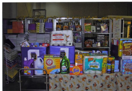
Some of the items that you donated to Sunnybrook Children's Home Spring Food Drive. See thank you note from Sunnybrook in the Sharing section of Windows.

Thank you, thank you, thank you. Let's always keep Sunnybrook in our minds and prayers and be looking for different ways we can minister to them throughout the year.