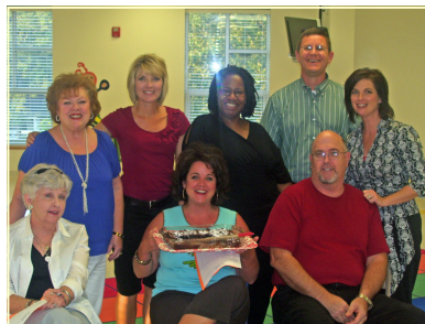
Story tellers had a great work session Wednesday night in preparation for the upcoming KFC season.